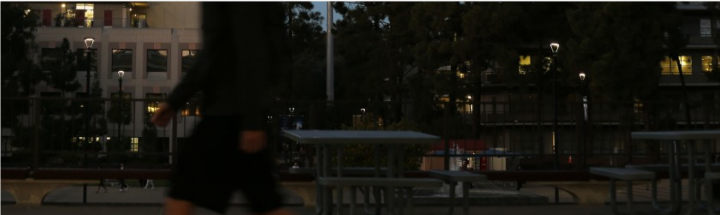
Los Angeles artist Mark Bradford's "What Hath God Wrought" is a 195-foot steel pole topped with a blinking light that transmits in Morse code the first message sent by telegraph.