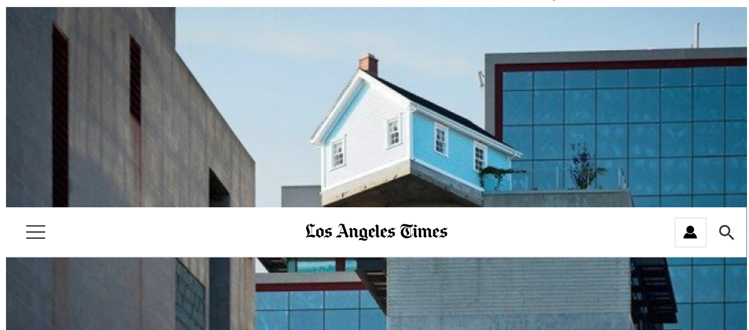
Perched on the corner of the 7th floor of Jacobs Hall above the busy artery through Warren College, the 15-by-18-foot house looks, indeed, like it came crashing down from above.